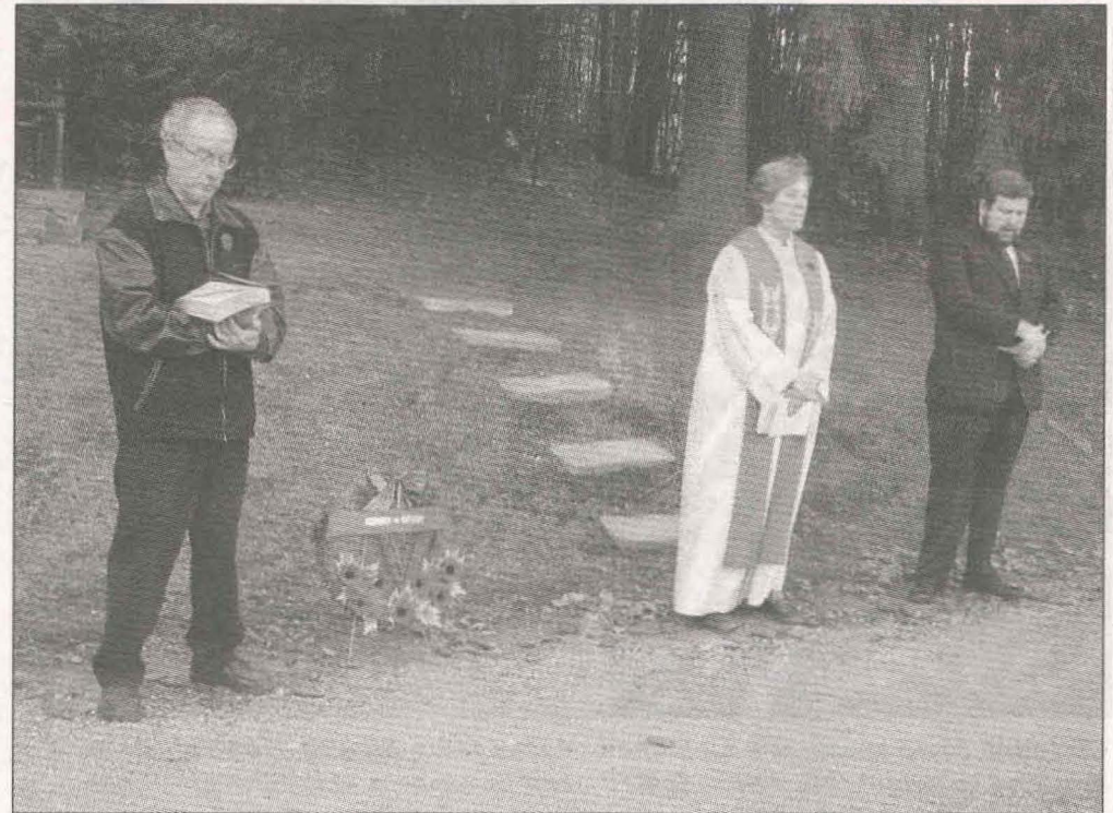
A service to honour Remembrance Day was held at Kettleby Cemetery this past Sunday.