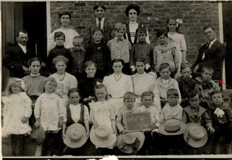
TENTH LINE SCHOOL CLASS 1909