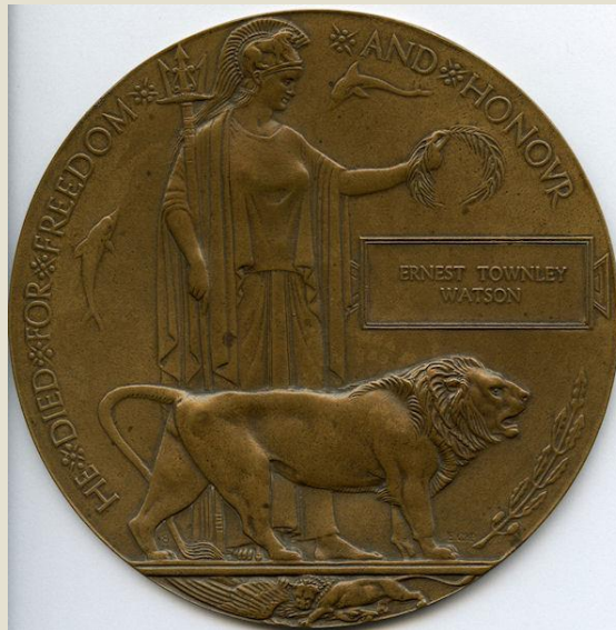
Canadian Virtual War Memorial